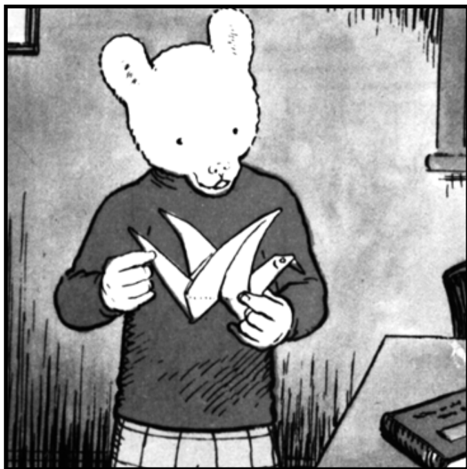
The paper bird - a traditional fold - that flew in the window in "Rupert and the Magic Dart" (B84, 1946 Rupert Annual)

O rigami, Japanese for paper-folding, is a fascinating and unique feature of Rupert Annuals. Many a happy post-Christmas holiday has been spent poring over a Rupert Annual in delight (frustration?) with an exquisitely folded (crumpled?) piece of paper, rapidly beginning to resemble an elephant, bird, Spark-Man (or perhaps not?).